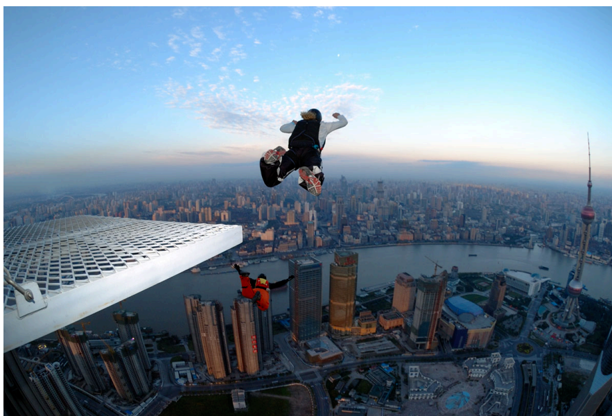
Figure 2.1: A base jumper is used as context to get familiar with representation, picture from https://commons.wikimedia.org/wiki/File:04SHANG4963.jpg

Physics problems and concepts can be represented in multiple ways, each offering a different perspective and set of insights. The ability to translate between these representations is one of the most important skills you will develop as a physics student. In this section, we examine three key forms of representation: equations, graphs and drawings, and verbal descriptions using the context of a base jumper, see Figure 1.